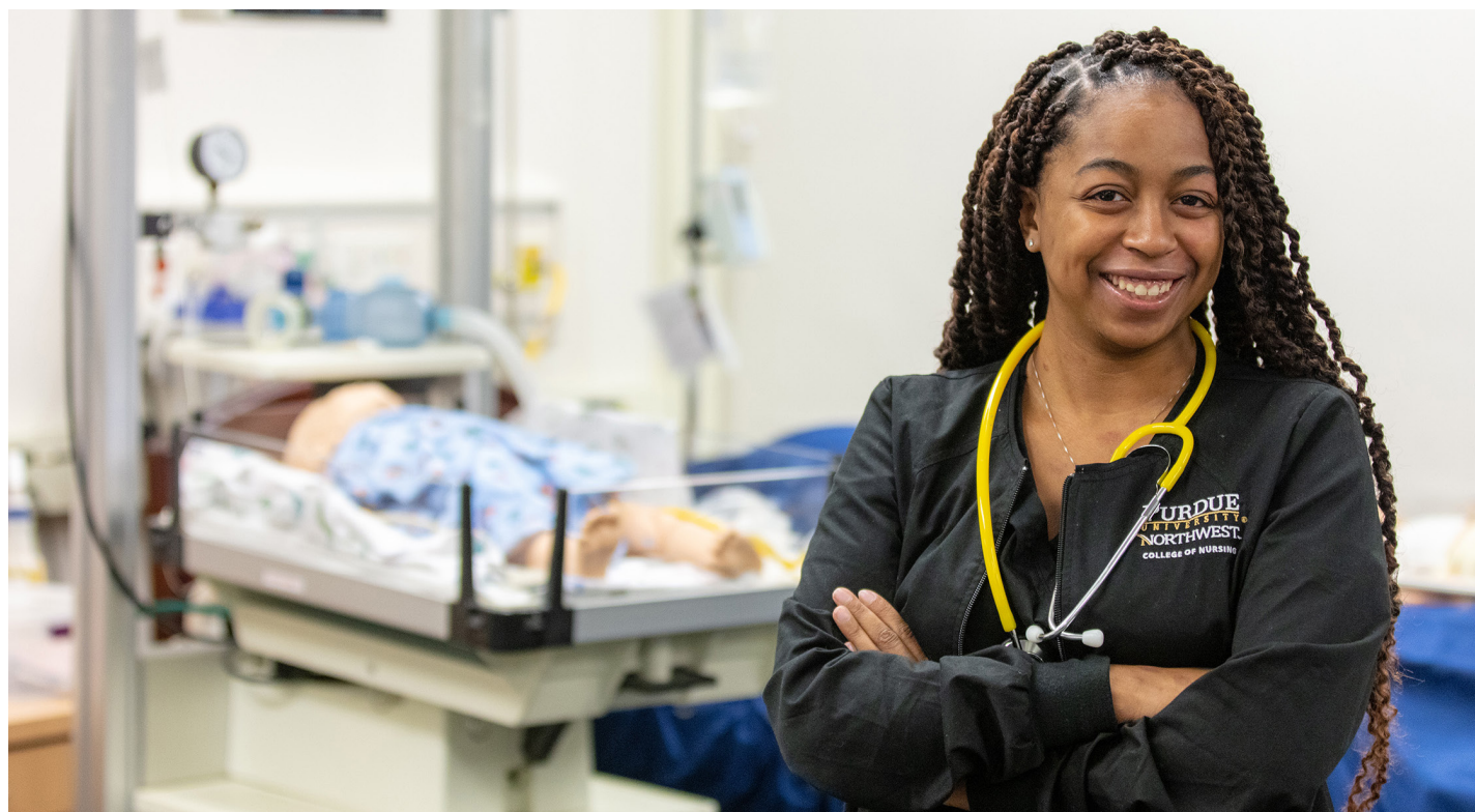
PNW student stands within the Robert J. Milos, M.D. & Margaret J. Milos, R.N. Nursing Assessment Center.