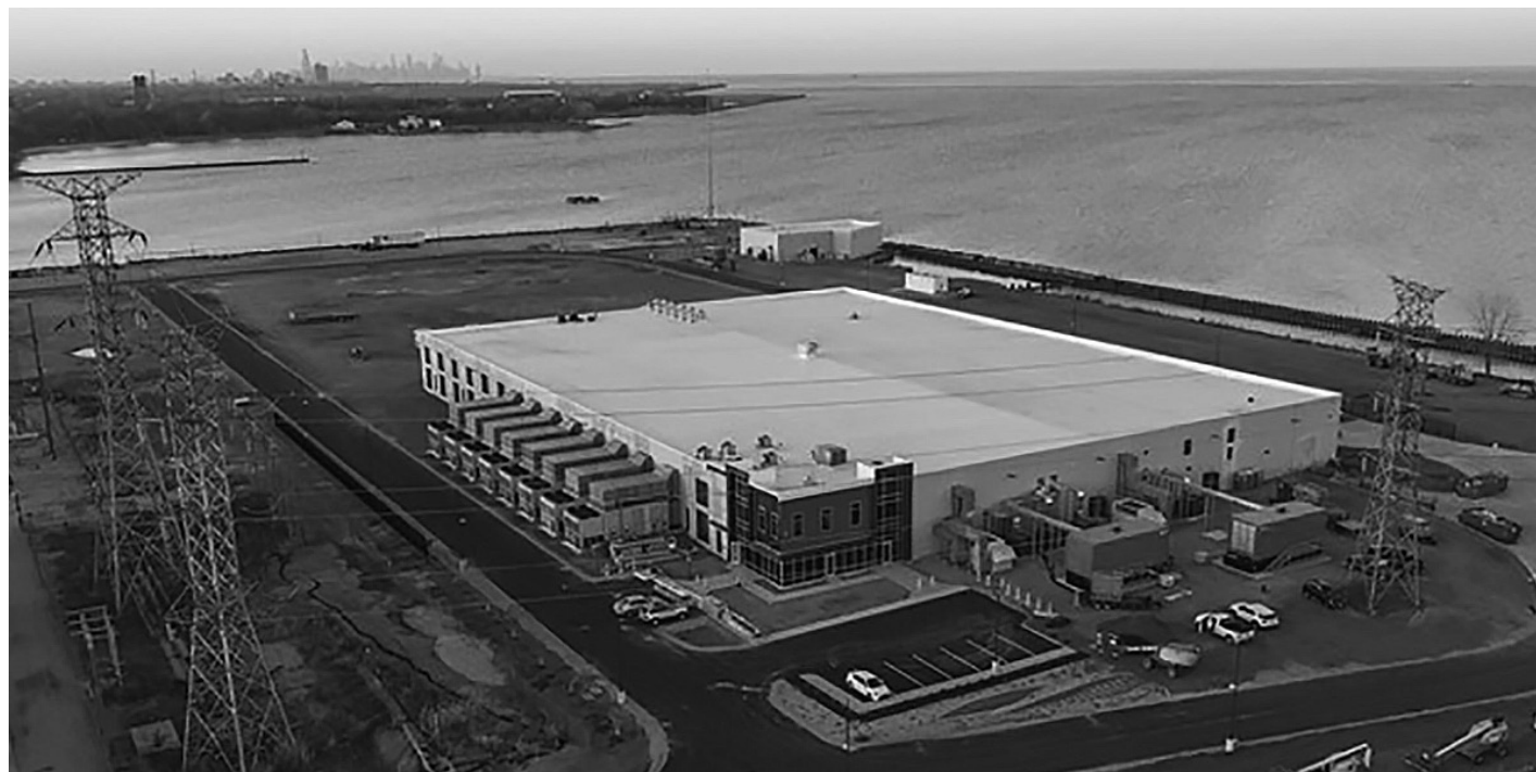
Digital Crossroad DX-1 Data Center in Hammond Indiana

Publicly traded firm with a global presence selects Digital Crossroad data center in Northwest Indiana