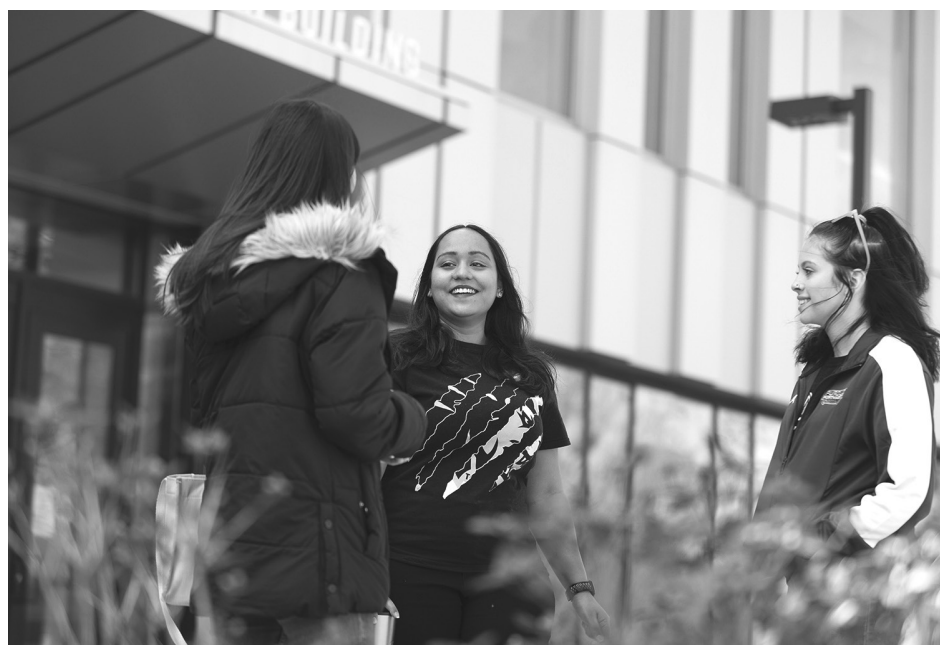
Purdue Northwest's fall enrollment figures show increases in first-time freshmen enrollment and transfer student enrollment, and an increasingly diverse student body.

Purdue University Northwest's (PNW) fall 2022 enrollment figures show positive trends of first-time freshman enrollment and increasing diversity at the university.