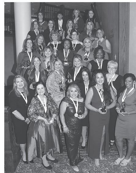
2022 Influential Women Winners