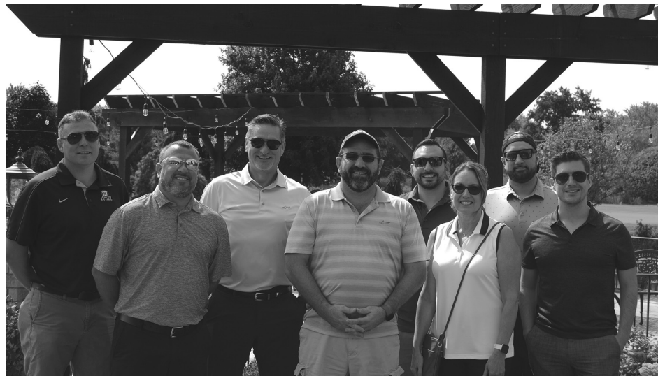
Two foursomes from top sponsor Hard Rock Casino of Northern Indiana strike a pose before hitting the greens.