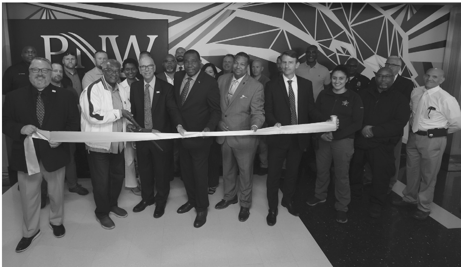
Dignitaries gather at Purdue University Northwest Sept. 25 for a ribbon-cutting and tour of the High Tech Crime Unit, a partnership between the Lake County Prosecutor's Office and PNW.

The Lake County Prosecutor's office, in partnership with Purdue University Northwest (PNW), celebrated the beginnings of their cooperation through a state-funded High Tech Crime Unit (HTCU) during a ribbon-cutting ceremony on Sept. 25.