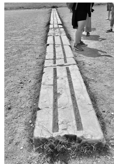
The starting line of the stadium in Olympia. Athletes had to place their toes in the front grooves on the block.

The Games continued through the Hellenistic period with more buildings added to the