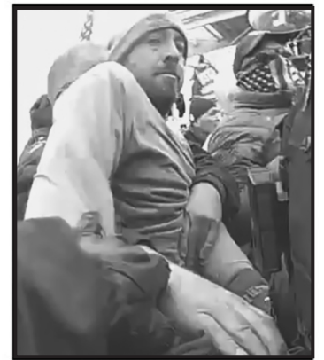
Photograph #403 AFO