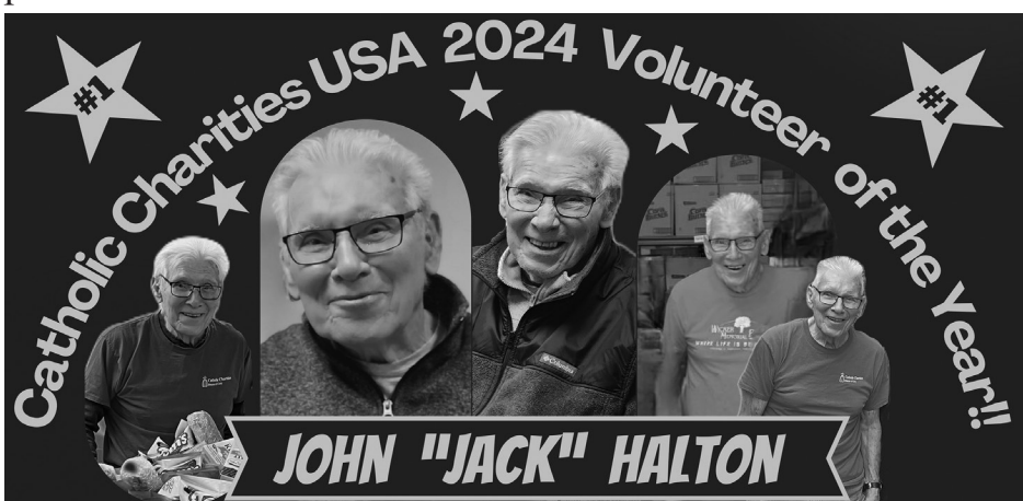
A celebratory collage of a joy-filled man.