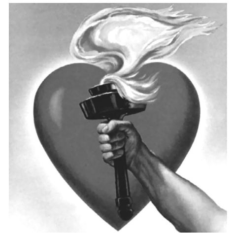
Since its founding in 1924, the American Heart Association has shined a powerful light on heart disease, its treatment and its prevention.